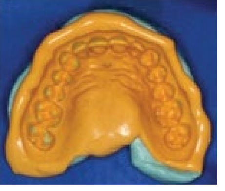
Figure 2: This impression will be suitable for commencement of sequential aligner therapy

Polyvinyl siloxanes (PVS) are addition reaction silicones elastomers.