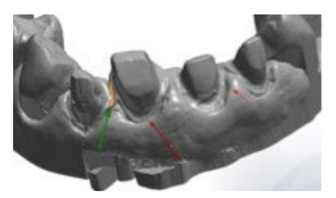
Figure 4: Digital impressioning will only capture data. The dentist is compelled to provide the necessary retraction. Arrows indicate lack of clarity

one of the most challenging procedures in clinical practice (Figure 3). For both conventional and digital impression techniques, an accurate final representation of the intraoral situation is crucial.