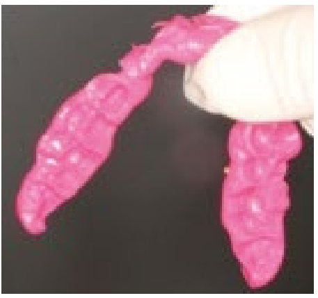
Figure 1: Full-arch polyvinyl siloxanes (PVS) with occlusal perforations confirms correct interocclusal registration

centre of the maxillary tray to reduce the bulk of alginate impression material.)