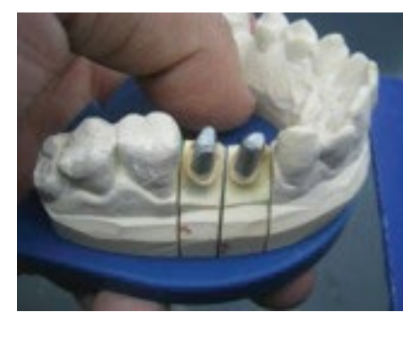
Figure 3: Clear, clean accurate margins are the cornerstone of successful restorative dentistry