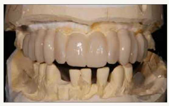
Provisionals from Digital Diagnostic Wax-ups