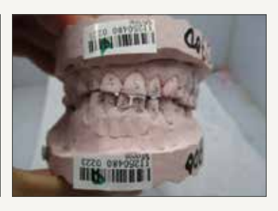
Increased vertical dimension